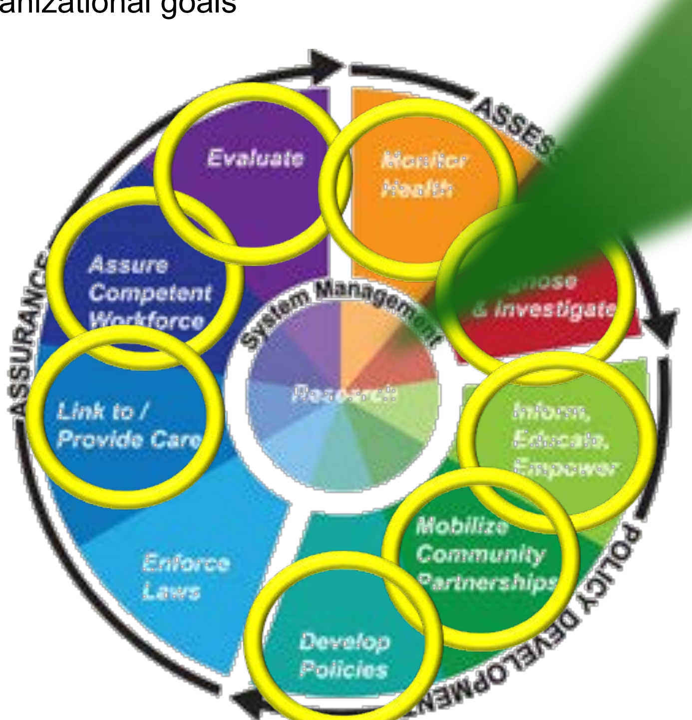
10 Essential Competencies